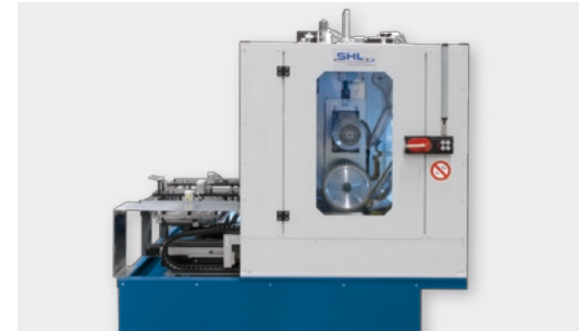
machine - sideview