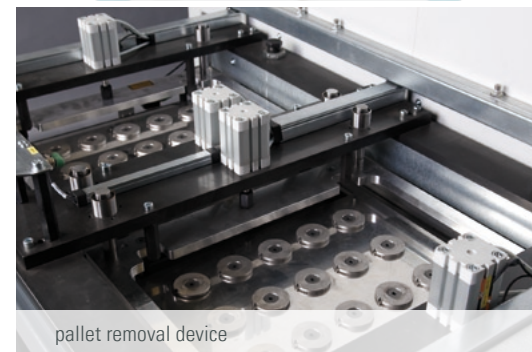
pallet removal device